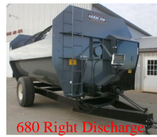
680 Right Discharge