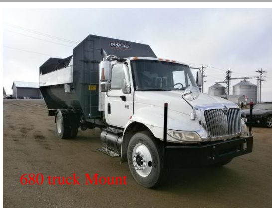
680 truck Mount