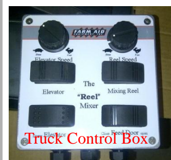
Truck Control Box

* We can equip all of our stationary mixers to run on 220 V single phase