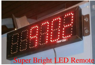
Super Bright LED Remote