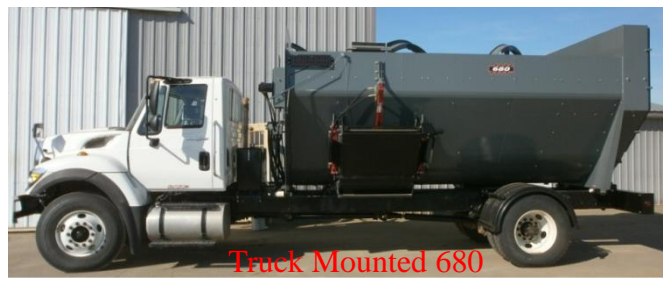
Truck Mounted 680