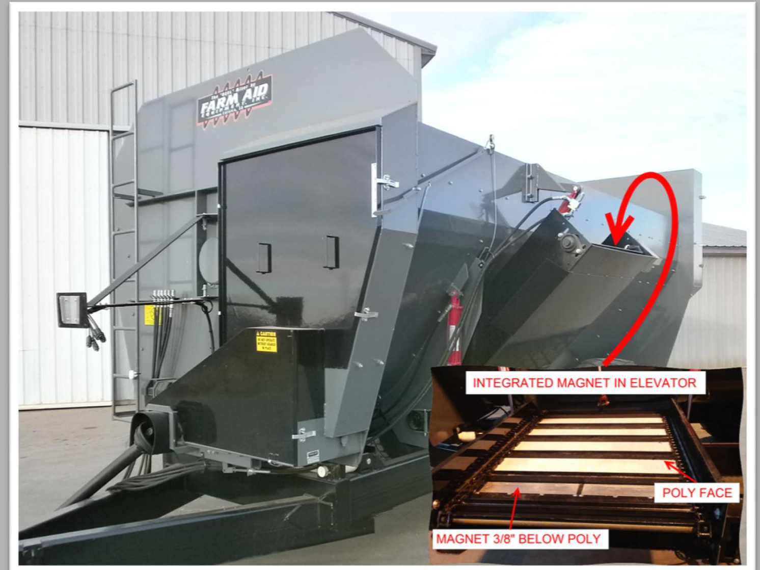
INTEGRATED MAGNET IN ELEVATOR

* We can equip all of our stationary mixers to run on 220 V single phase