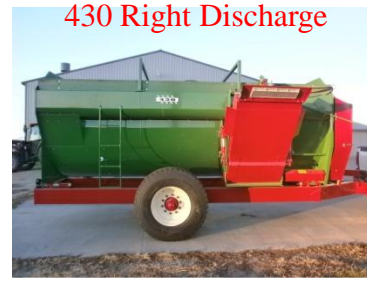
430 Right Discharge