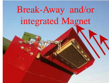
Break-Away and/or integrated Magnet