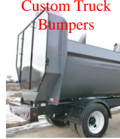
Custom Truck Bumpers