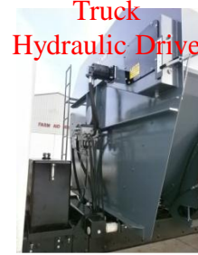
Truck Hydraulic Drive